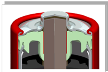
Additional View (1) Positive End