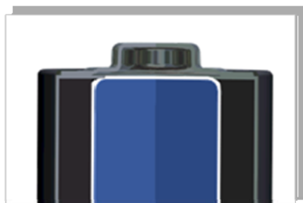
Additional View (1) Positive End